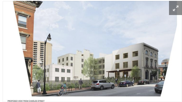
A rendering of the new windows and landscaping renovations planned for 1030 N. Charles St. ROHRER STUDIO